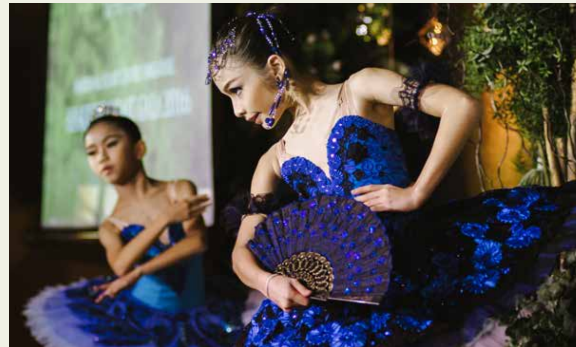
Talented young ladies aged six to 11 years from The Ballet School Singapore enraptured guests with their elegant leaps and turns, much inspired by the birds and butterflies waltzing through their arboreal home.