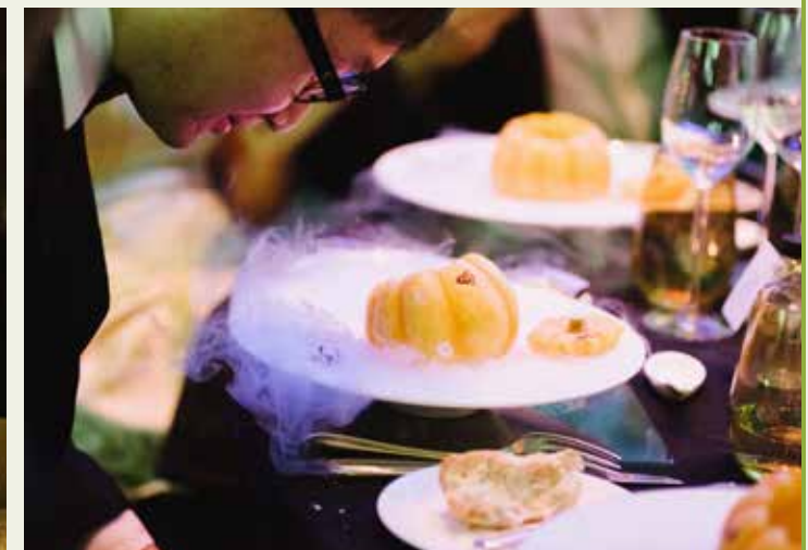
Guests were treated to an intriguing and tantalising dining experience which evoked images of bubbling creeks and treasure-filled chocolate wheelbarrows.